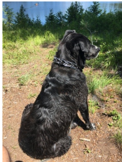
My Lab Miley, focused on a group of ducks at Bull Prairie Reservoir last July dreaming of the upcoming waterfowl!

Well, the month of November has relegated me to picking up mass amounts of leaves in my oversized yard and me wondering why I planted so damn many trees. As I trudged through mounds of leaves, my neighbor and self-proclaimed prepper stopped by. He must have heard about how successful I was big game and turkey hunting this year (NOT) because he came toting a 27.6 pound farm raised turkey all dressed and everything for the Thanksgiving holiday. At least, I still have upland bird and waterfowl hunting to look forward too.